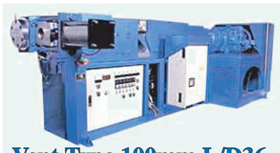
Vent Type 100mm L/D36