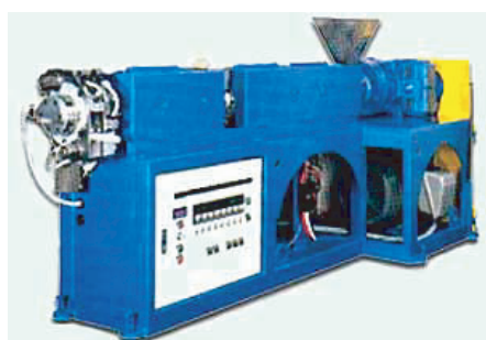
Vent Type 65mm L/D